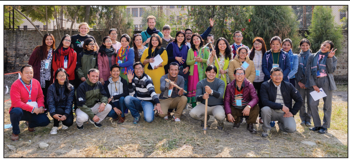
Start off a new chapter in Outdoor Education through Pathshala Karesa Bari Program

Pathshala Karesa Bari program is an innovative concept that focuses more on food and on bringing back the focus to sustainable growing. It helps to reconnect students with natural world and the true source of their food, and teach them valuable gardening and agriculture concepts and skills that can be integrated with several subjects.